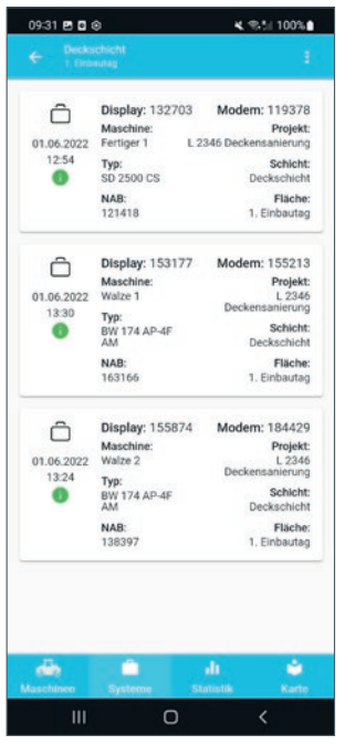
Statistics on construction progress