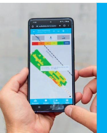
Browser-based Web App for all mobile devices (Android, iOS and Windows)