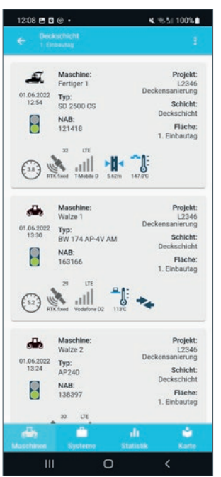
Operating states of the machines deployed